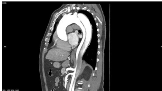
Figure 1: Depiction of the Stanford B aortic dissection before TEVAR.

nated from an 10mm entry point in proximity to the ostium of the LSACA extending to the descending aorta with maximum false lumen diameter 15mm and maximum aortic diameter 50mm. His medical background consisted of diabetes mellitus and hypertension under treatment. Although OMT (Optimal Medical Therapy), including painkillers and antihypertensive treatment, was administered, the patient suffered from persistent pain and CT angiography 14 days after onset of symptoms revealed an entry tear >10mm with a false lumen diameter >20mm and an increase in total aortic diameter >5mm in comparison to the initial angiography (fig. 1). After consideration of these high-risk features for subsequent complications prompted the endovascular solution 5 .