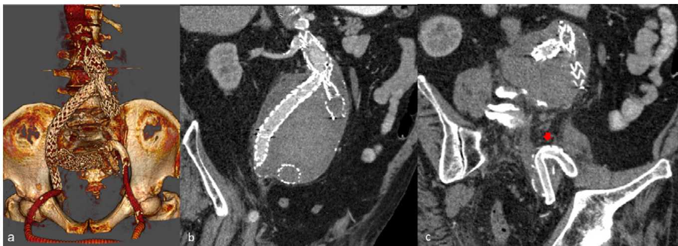
Figure 3 (a,b,c). Post-op CT scan image demonstrating sealing of the endoleak and patent reverse- U stent graft